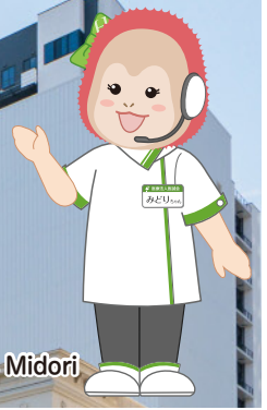
Character: Midori chan/ Miss Midori