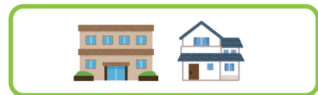
Nearby Hospitals · Facilities · Private Homes

4 Physician-staffed emergency vehicles 2 Ambulances · 7 Transport Vehicles